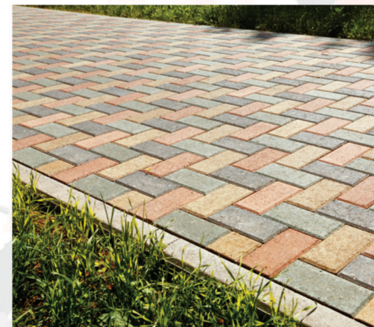
Parking Paver blocks