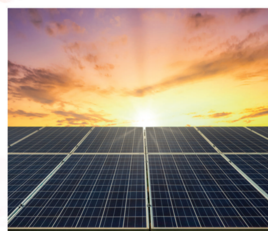
Rooftop Solar PV Systems