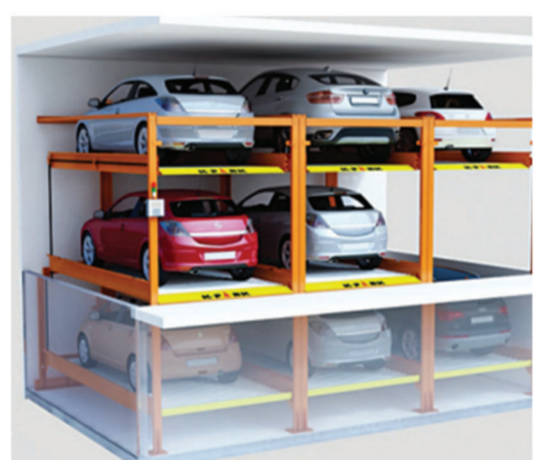
Pit Puzzle Car Parking