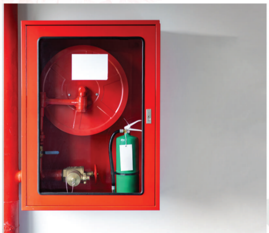
Firefighting Systems With All Fittings With ISI Marking