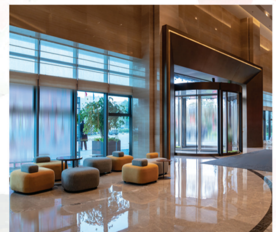
Decorative Entrance Lobby