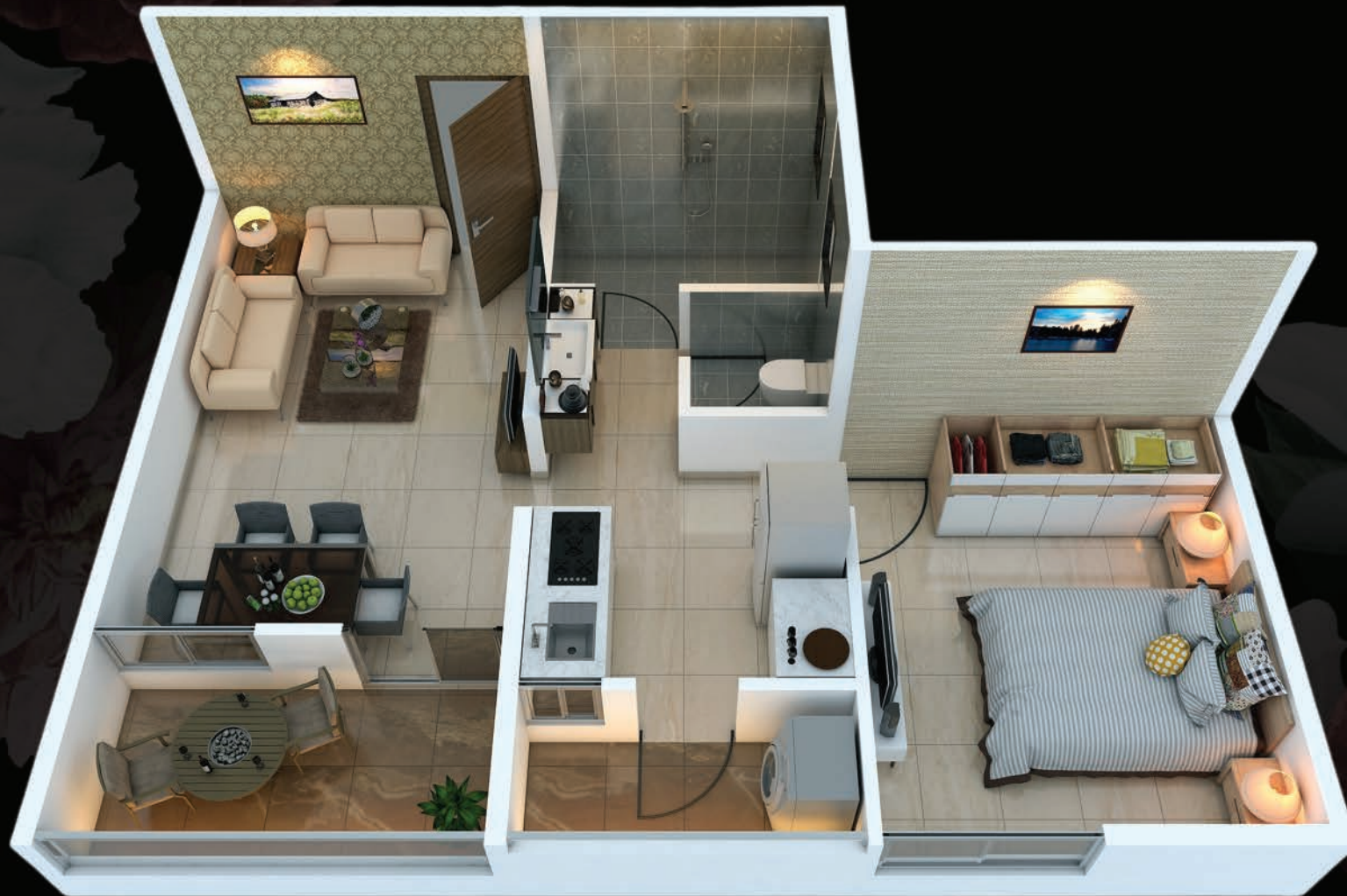
1 BHK Apartment Layout ( 489 SQ. FT )