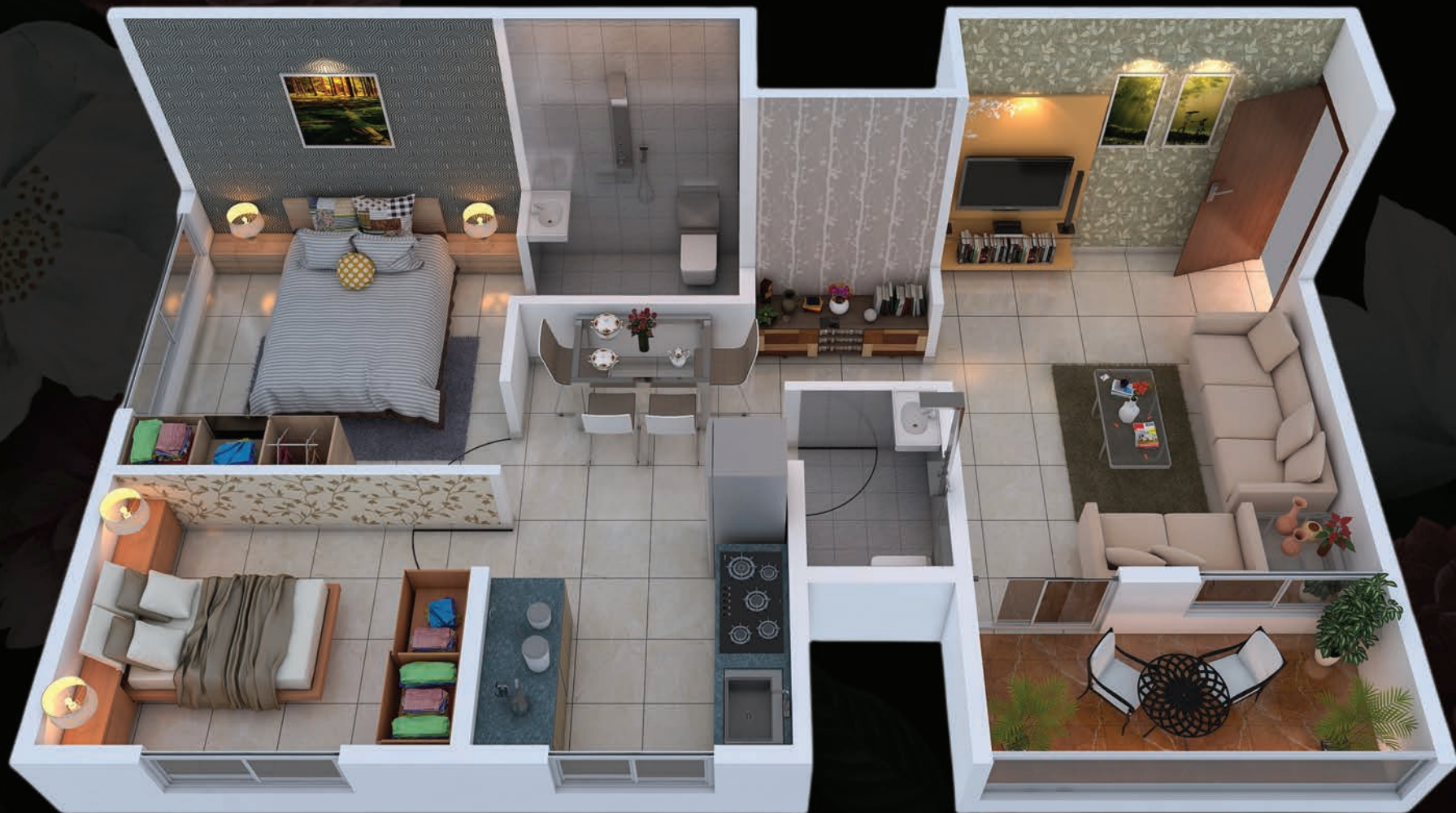
2 BHK Apartment Layout ( 614 SQ. FT )