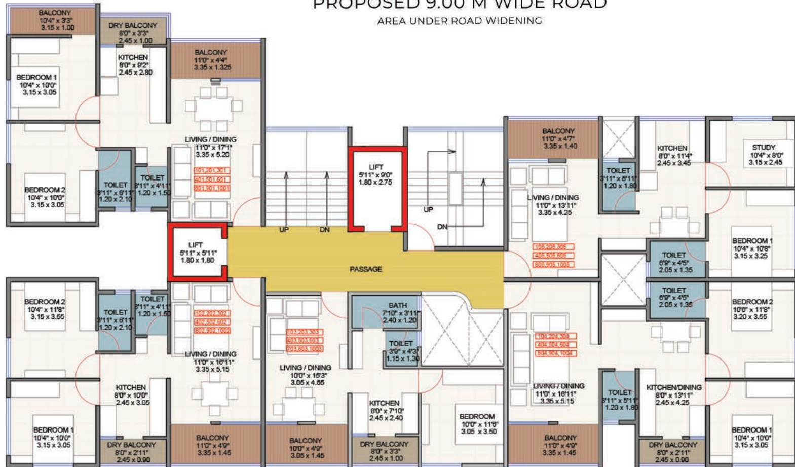
RERA SALABLE AREA STATEMENT (SQ.FT)