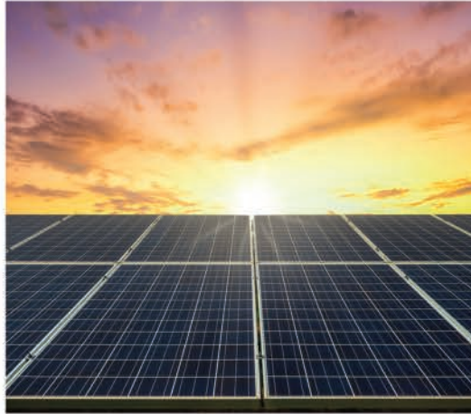
Rooftop Solar PV Systems