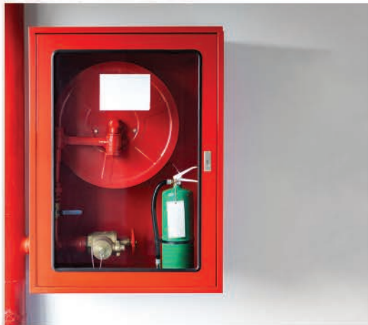
Firefighting Systems With All Fittings With ISI Marking