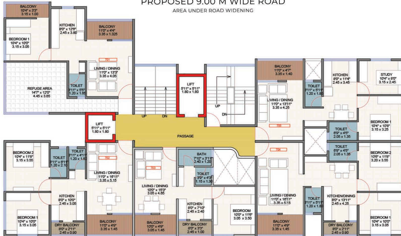
RERA SALABLE AREA STATEMENT (SQ.FT)