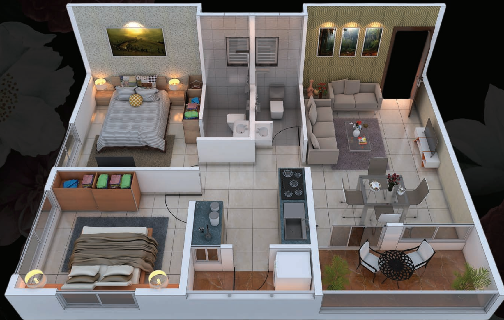
2 BHK Apartment Layout ( 648 SQ. FT )