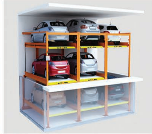
Puzzle Car Parking