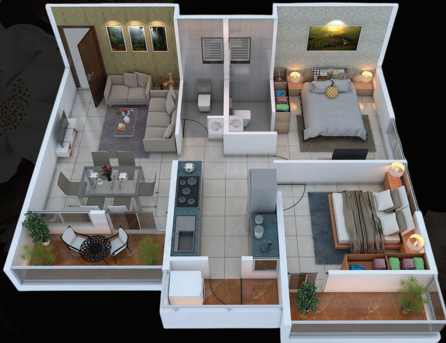
2 BHK Apartment Layout ( 704 SQ. FT )