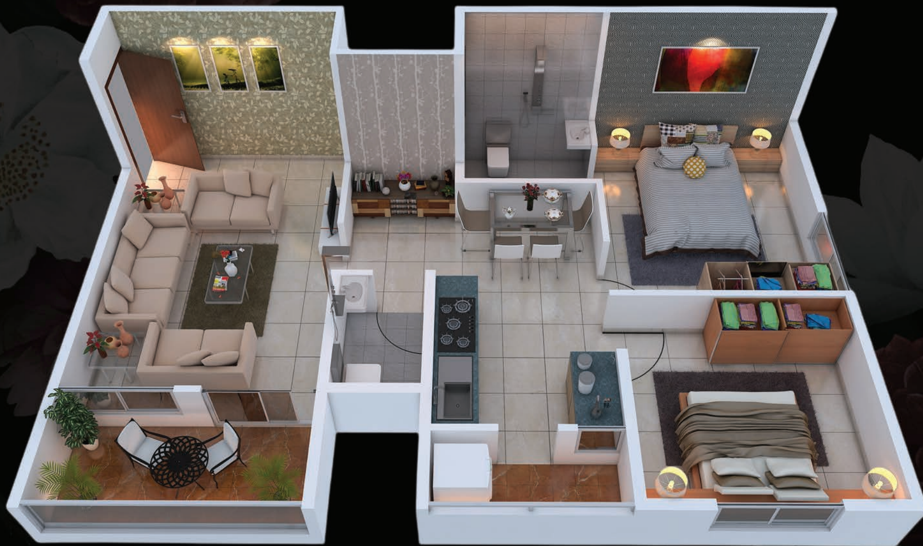
2 BHK Apartment Layout ( 714 SQ. FT )