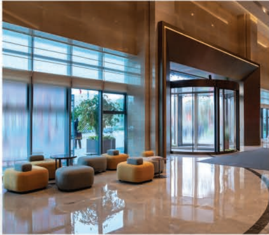
Decorative Entrance Lobby