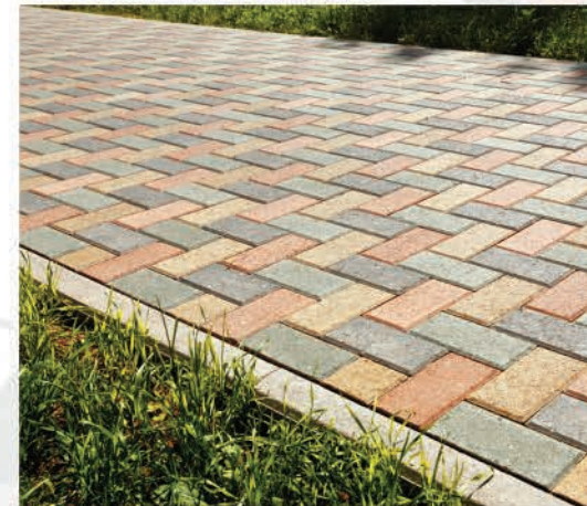
Parking Paver blocks